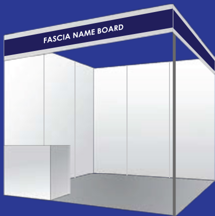
*Illustrations are for reference only